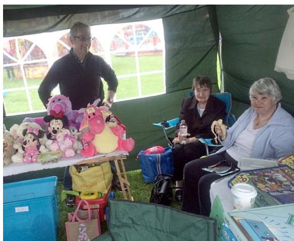
Braving the weather - but still smiling!

Our thanks go to those volunteers who turned out to help regardless of the elements – thank you everyone.