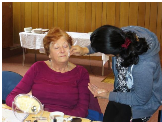
Look Good Feel Better session