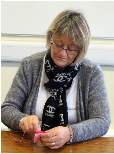
Craft work with Life Long Learning