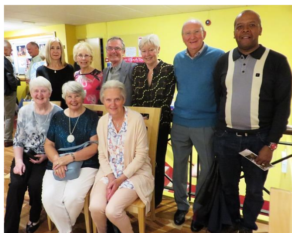
Some of our volunteers during the interval.

We raised a fantastic £597.50 on the evening which also included a raffle and a generous donation of £50 from the Oldham Metro Rotary Club.