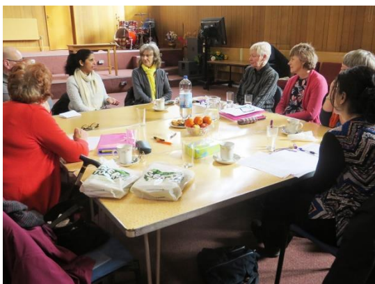
Discussion with past cancer patients

The programme is extremely varied and includes sessions on safe exercise, dealing with fatigue, nutrition, relaxation and meditation, safe skin care, podiatry, first aid, interest groups/classes, possible re-training/CV work, voluntary work, colour analysis and a pampering session at Oldham College. For the first time we have also included a session on 'Gardening as Therapy' and everyone agreed that this was a very useful and enjoyable session.