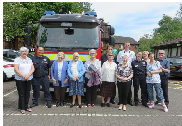
Members of the group with Fire Service personnel

So give yourselves a break and join us – you'll be glad you did.