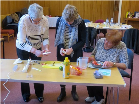
Making Macmillan fresh juices