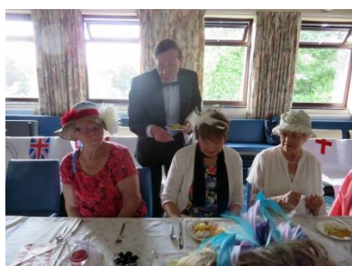
Gordon, the butler