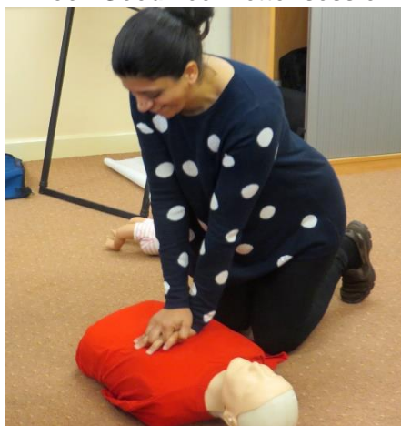
First Aid with the Red Cross