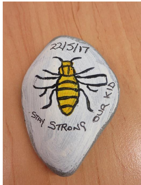
~ reference to the atrocity at the Manchester Arena ~