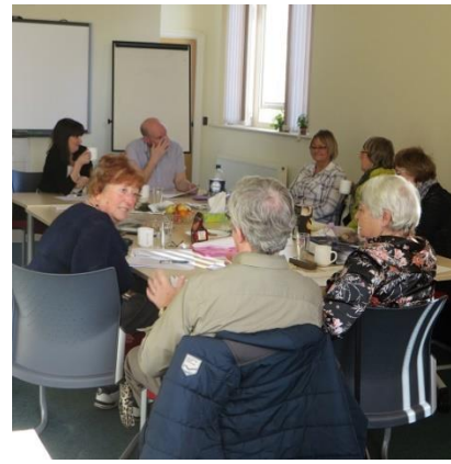
Trying to get to grips with the Benefits System