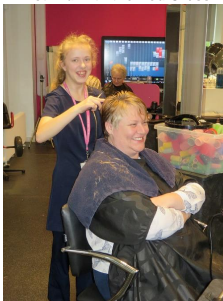
Pampering at Oldham College .....