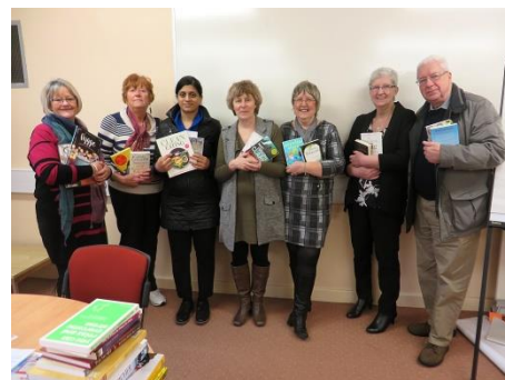
Therapy in reading

Each of the sessions is delivered by an expert in their field.