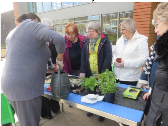
Gardening as Therapy